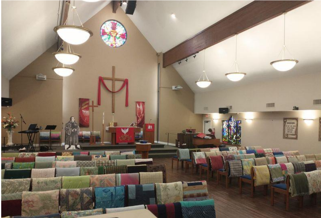
Peace, Service Team