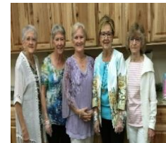
Father's Day Cooks