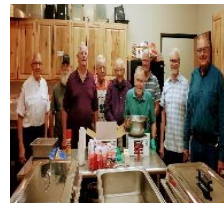
Mother's Day Cooks