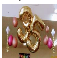
Peace 35 th